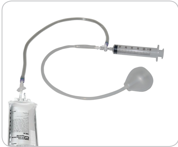
Option 1: Direct Saline Inflation

Spike a 500 ml bag of fluid. Prime the tubing by attaching the syringe and drawing fluid. Using three-way stopcock connect syringe to balloon catheter. Push fluid into the balloon.