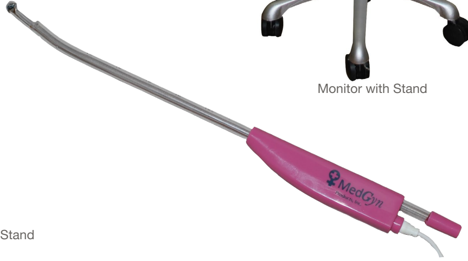
Endoscopic (Hysteroscopic) Cannula