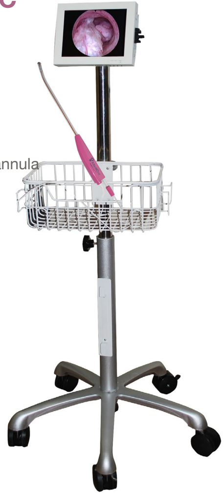
Monitor with Stand