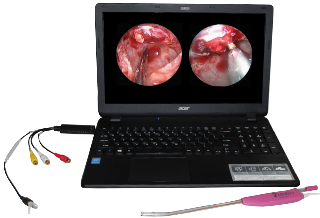
Image Capture Software with Laptop