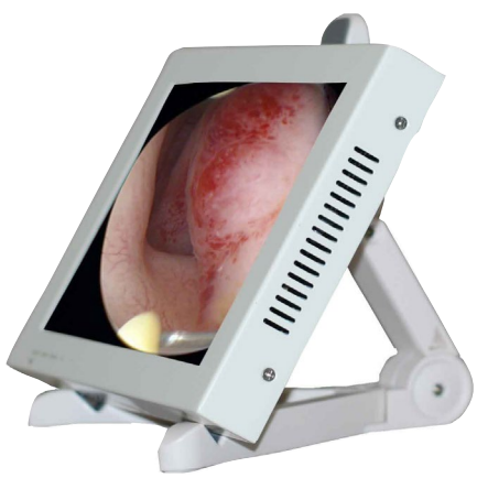
Monitor without Stand