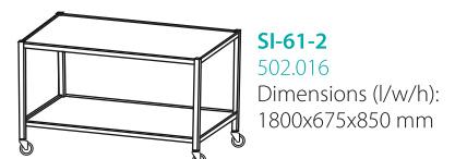
SI-61-2 502.016 Dimensions (l/w/h): 1800x675x850 mm