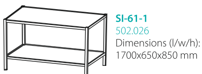
SI-61-1 502.026 Dimensions (l/w/h): 1700x650x850 mm