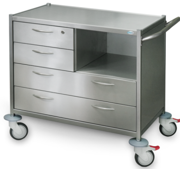
SM-K-A 506.100 Dimensions (l/w/h): 1060x655x915 mm