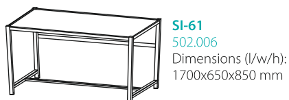
SI-61 502.006 Dimensions (l/w/h): 1700x650x850 mm