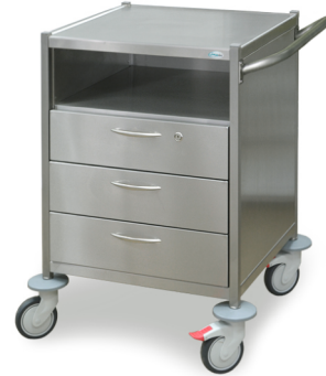
SM-K-A1 506.200 Dimension (l/w/h): 760x655x915 mm